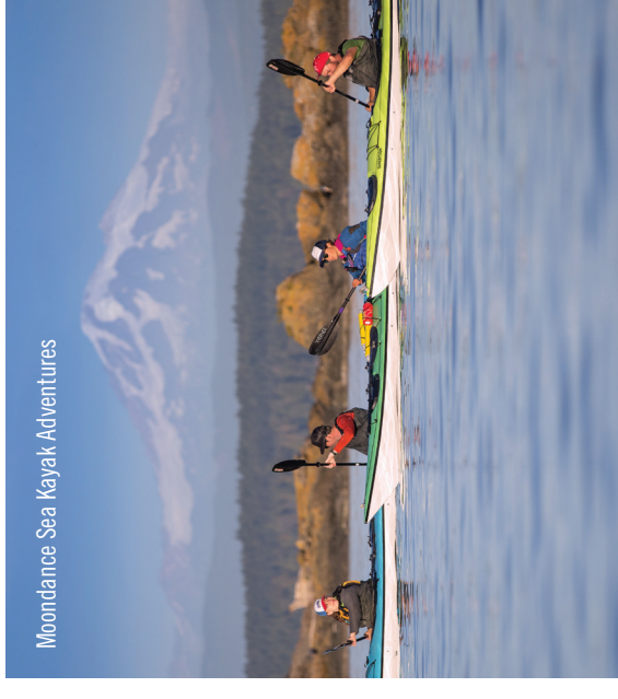
Moondance Sea Kayak Adventures